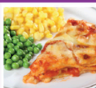
Tomato Tortilla Stack (V) served with Potato Wedges & Seasonal Vegetables