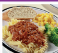
Pasta Bolognese served with Crusty Bread & Seasonal Vegetables