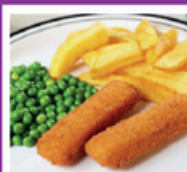
Cod/Salmon Fish Fingers served with Chips, Baked Beans or Peas