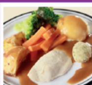
Roast Chicken Lunch served with Roast/Mashed Potatoes, Seasonal Vegetables & Gravy