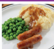
Sausages served with Mashed Potato, Gravy & Seasonal Vegetables